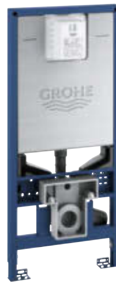
39 602 000 Rapid SLX WC 3-6 | 1.13 m US

Rapid SLX Element for WC, 1.13 m installation height with flushing cistern GD2, with electric socket, including flow manager, easy access. Including pipe-in-pipe connection.