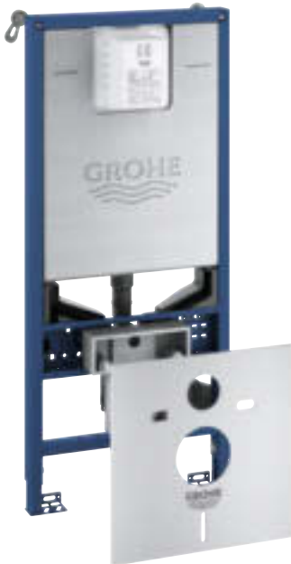
39 598 000 Rapid SLX 3in1 WC 6 | 1.13 m with wall brackets and noise protection

Rapid SLX Element for WC, 1.13 m installation height with flushing cistern GD2, with electric socket, including flow manager, easy access. Specifically for Saudi Arabia with different settings.