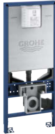
39 601 000 Rapid SLX WC 3-6 | 1.13 m, SASO

Rapid SLX Element for WC, 1.13 m installation height with flushing cistern GD2, with electric socket, including flow manager, easy access and fully insulated against condensation. With heavy load feet.