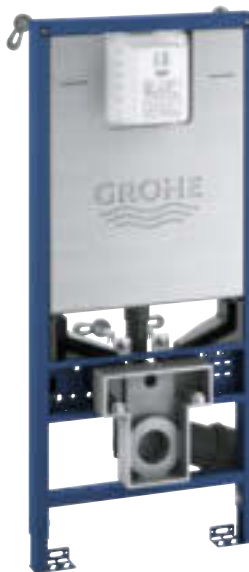
39 600 000 Rapid SLX WC 3-9 | 1.13 m SC Nordics adapter

Rapid SLX Element for WC, 1.13 m installation height with flushing cistern GD2, with electric socket, including flow manager, easy access and fully insulated against condensation. With wall brackets and noise protection.