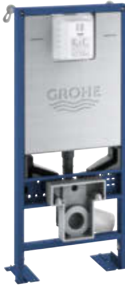
39 599 000 Rapid SLX WC 3-6 | 1.13 m F with heavy load feet

Rapid SLX Element for WC, 1.13 m installation height with flushing cistern GD2, with electric socket, including flow manager, easy access and fully insulated against condensation. Without outlet pipe.