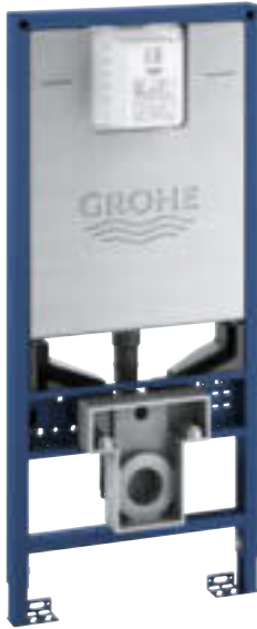
39 597 000 Rapid SLX WC 3-6 | 1.13 m, without outlet pipe

Rapid SLX Element for WC, 1.13 m installation height with flushing cistern GD2, with electric socket, including flow manager, easy access and fully insulated against condensation. Without outlet pipe.